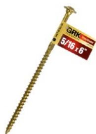
GRK® RSS™ 5/16in x 6in Grade C Yellow Zinc Washer Head Structural Screw

Residential applications only. Available at Menards.