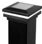
Post Cap Lights