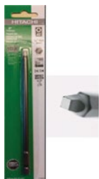
6in #2 Square Drive Bit