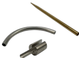
Horizontal Cable Tool Kit (Use with Horizontal Cable Railing)