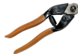
Stainless Steel Cable Cutter (Use with Horizontal and Vertical Cable Railing)