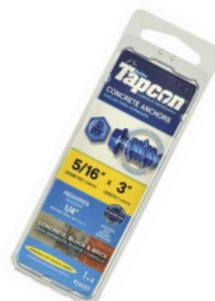
Tapcon® 5/16in x 3in Hex Washer Head Concrete Anchor

Residential applications only. Available at Menards.