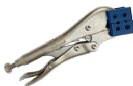
Cable Gripper Tool (Use with Horizontal Cable Railing. Attaches to Irwin Brand Vise Grip Model 7R, sold separately)