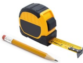
Tape Measure and Pencil