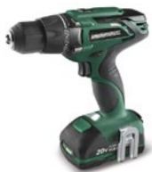
Cordless Drill (hammer drill for concrete)