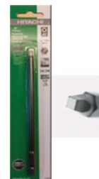
6in #2 Square Drive Bit