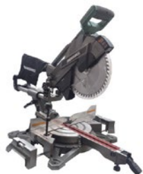
Miter Saw (with nonferrous blade)