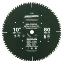
84-Tooth Nonferrous Blade